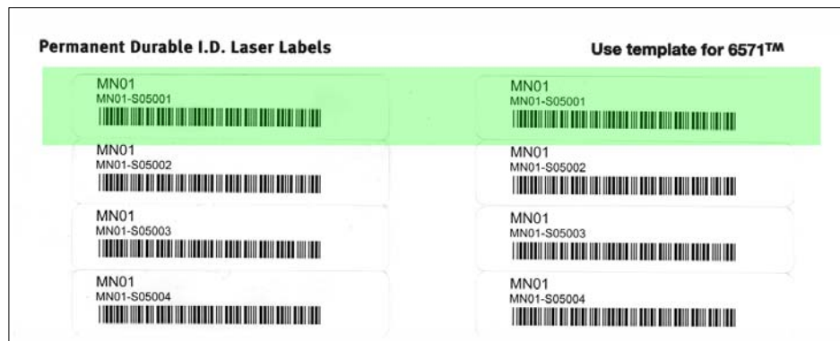
Sample ID Labels