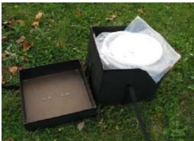
New bucket and lid in carrier

Field Observer Report Form (FORF), as started the previous week FORF, for next week's sample new bucket in protective plastic bag new lid in protective plastic bag fresh (< 6 months old) deionized or distilled water in a plastic squeeze bottle paper towels or lab wipes (e.g., Kimwipes * ) carrier (if used) for supplies, lid, and new bucket log book, if used