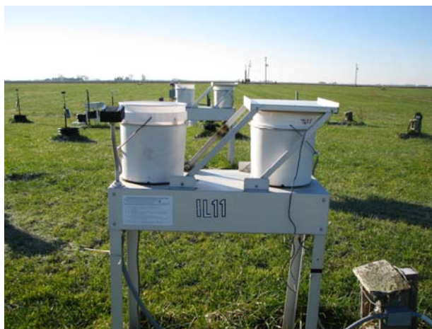
Aerochem Metrics bucket collector